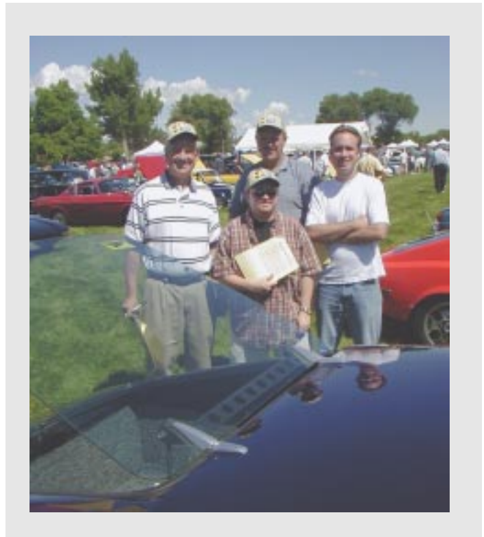
Happy RMSC members among the dozen Saabs at the 2005 CP Car Show in Littleton last June. Get your Saabs ready to make an even bigger showing this year.

The CP committee is looking for sponsors at various levels. The highest levels of sponsorship (Corporate) are $15,000, $10,000, $7,500, $5000, $2500, $1000, and $500. Other levels of sponsorship are called "Friends" and the levels run from $100 to just under $500. The "friends" don't get VIP passes, Event Program ads, tables, tents or parking spaces that the higher level sponsors get, but do get noted in the programs, just as we did last year.